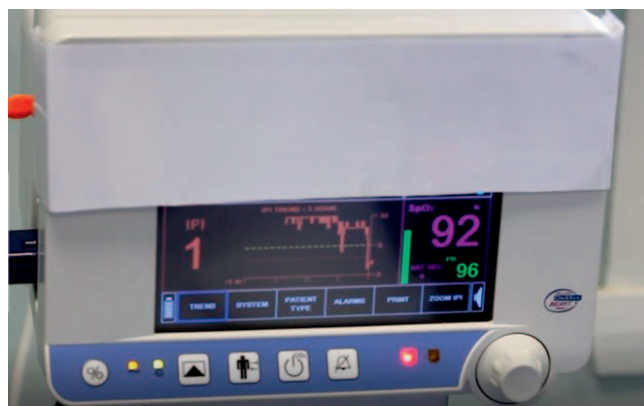
Figure 2. Vital signs monitor with capnography information obscured.

On visual inspection of the oropharynx, a lesion was discovered attached to the uvula (Figure 3). The pedunculated nature of the lesion allowed it to extend and partially obstruct the airway, analogous to a bungee cord. The lesion was immediately excised without local anesthesia as it was felt to be an urgent condition requiring attention. Histopathology reported the lesion (0.8 × 0.9 × 0.5 cm) as a benign squamous papilloma. He went on to have the impacted mandibular teeth removed