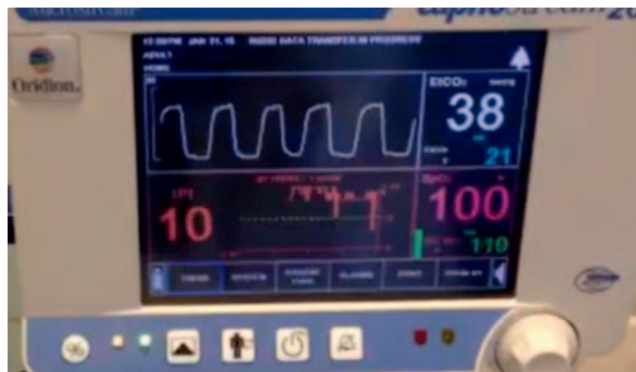
Figure 1. Example of monitor with capnography displayed.

(RR), SpO 2 , and pulse rate (PR) readings were continuously recorded (Figure 1).