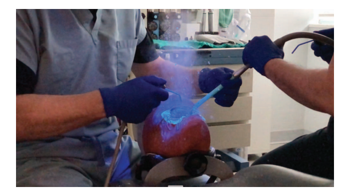
Figure 1. Splatter captured during the use of an air-water syringe and continuous high-volume evacuation suction.

Figure 1 captures the extent of splatter as the airwater syringe was used with HVE. The majority of splatter on the dentist was seen on the hands and arms, whereas smaller amounts were seen on the face, body, and legs (Figure 2). The majority of splatter on the dental assistant was observed on the hands and arms, but a large amount of splatter was also seen on the legs. A smaller amount of splatter was noted on the dental assistant's body; however, no splatter was detected on the face (Figure 3).