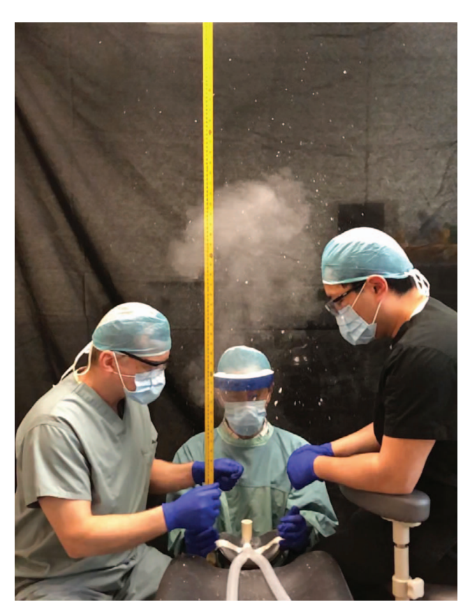
Figure 4. Plume and splatter captured during the simulated cough.

All participants at minimum wore droplet precautions throughout the entire study. Only one run of each simulated AGP and cough was performed and analyzed for these reasons. In addition, because there was no blinding of the participants, inherent biases may be present; however, all participants were practicing dentists and anesthesiologists familiar with all procedures performed.