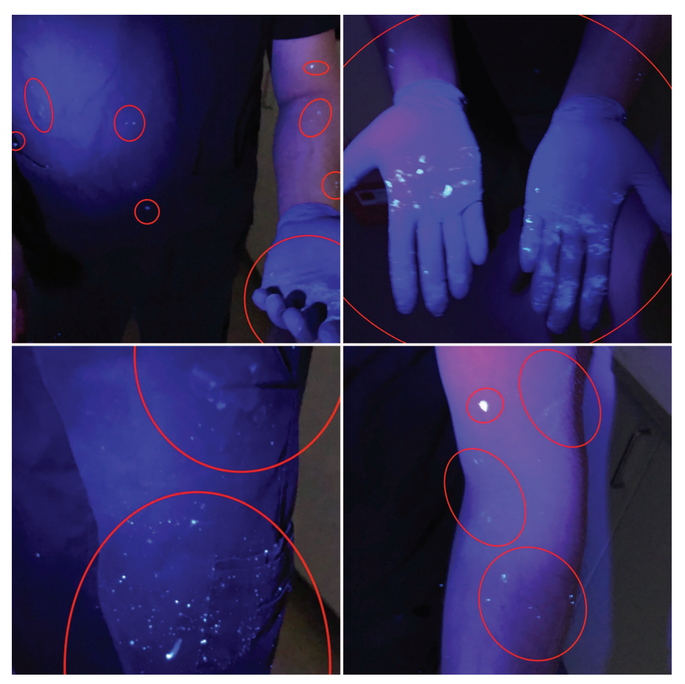
Figure 3. Splatter on dental assistant after aerosol-generating procedures, with the majority evident on arms and legs.

single site in an operatory where dentistry and anesthesia is performed in an outpatient facility. As such, ventilation and airflow in this environment may not accurately reflect all dental offices, which may affect spray and aerosol contamination patterns. The duration of each AGP used was significantly shorter than a typical dental appointment, and therefore this study likely underrepresents the extent and level of